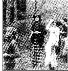
Some familiar faces on a WGNSS Forest Park bird walk in 1974.

Finding a rarity is an exciting event for a birder, but in the past only a few lucky birders were in the right